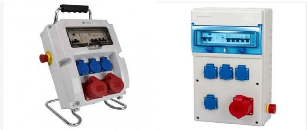
Single-phase + three-phase pre-equipped site box with emergency stop